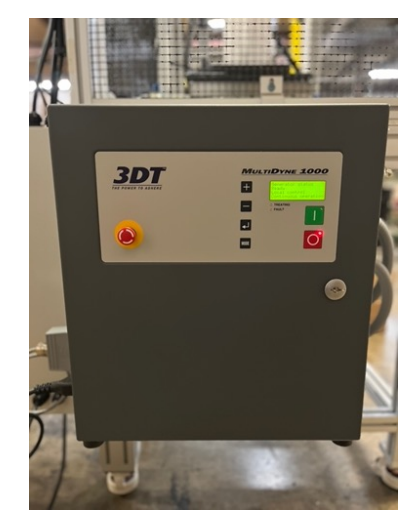
3-DT corona pre-treatment electrical / generator.