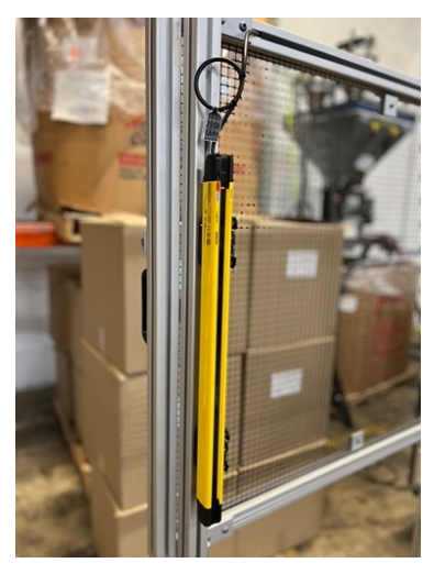
Light curtain mounted to access door / interlock.