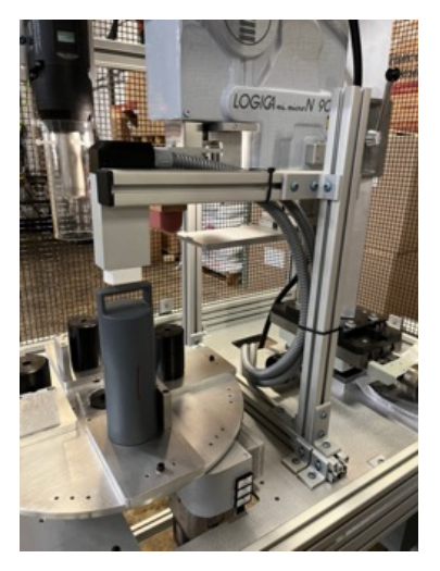
3-DT corona pretreatment head mounted using 80/20 for X and Z axis adjustment over part on rotary dial.