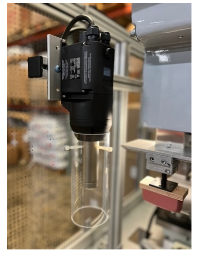
Leister hot air gun head mounted using 80/20 for X and Z axis adjustment over part on rotary dial.