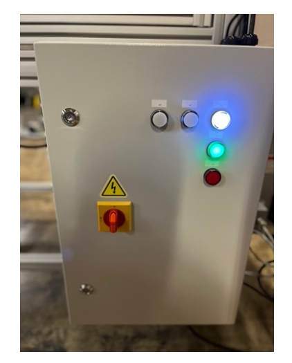
Main electrical cabinet with Power and "ready" indicator lights.