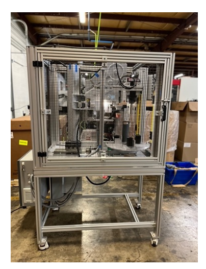
Side view. Note casters.

240 Smith Street Lowell, MA 01851 978.459.6533