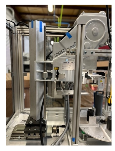
Mounting post with Z axis adjustment on top of the TO-200 XY cross table.