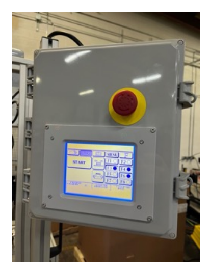
TOSH touch screen HMI with Emergency Stop.