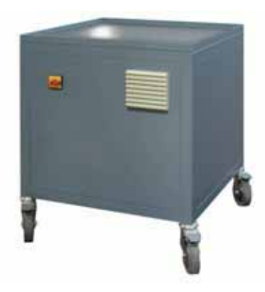
SPECIFICATIONS MAY BE SUBJECT TO CHANGE WITHOUT NOTICE

For K4 turbo blower assembled on swivel wheels and equipped with air suction fan.